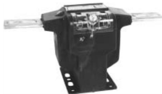
JKM-2 Current Transformer

Wiring Diagram ....refer to page 42, figure 4