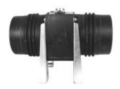
JCD-3 and JCD-4 Current Transformer