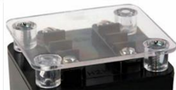
Clear Plastic Cover