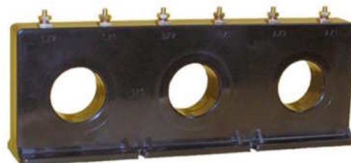
(For Horizontal Mounting)