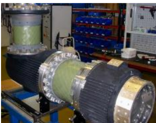
GCB - Active Parts

GE can also support groups of customers within the same region by defining the process and content of a shared safety stock that meets their specific needs and constraints.