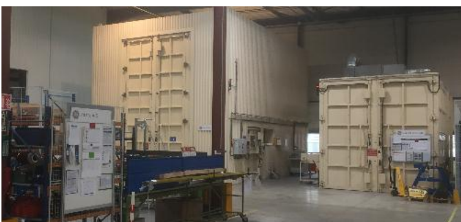
High voltage dielectric, electronic and mechanical testing capabilities at GE GCB Service Worldwide Center of Excellence.