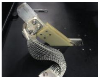
GCB - Switch