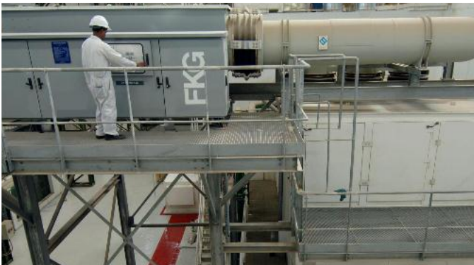
Preventive maintenance onsite work can be scheduled in advance within the generator outage planning.

Every 10 or 20 years: Upgrade or replacement of the mechanism and renovation of the pole is performed taking into account the model, number of operations, electrical wear limit and the diagnostics from the previous periodic activities.