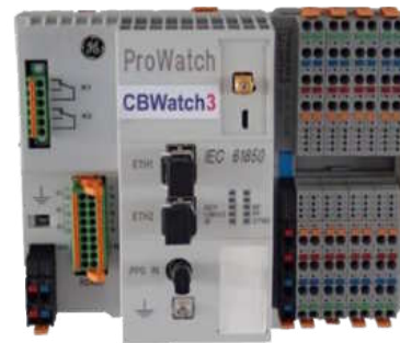
Online monitoring solution CBWatch 3.