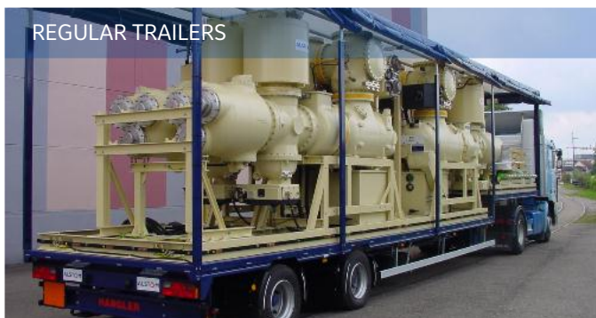
Could be transported without special traffic authorization