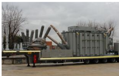
EON (SPAIN) 132-55/30-20-12 kV 20 MVA

4 GIS Bays F35-132/66 kV, on a single trailer: The protection and control and auxiliary services equipment to operate the bays is integrated as part of the trailer. No special permits needed for transportation.