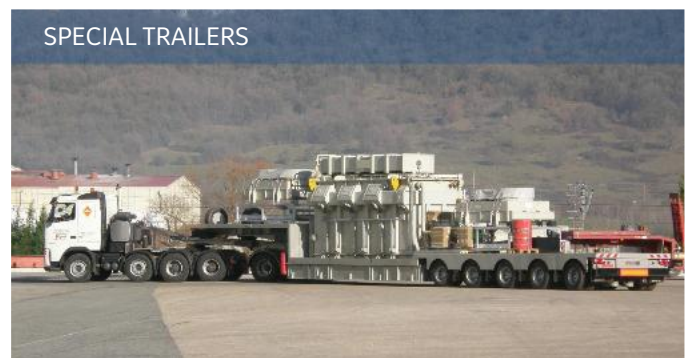
Have to be transported with special traffic authorization