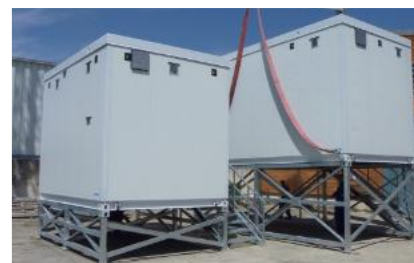
EON (SWEDEN) 170/52.5 kV 35 MVA

Complete mobile substation composed of 3 trailers: Hybrid switchgear with 20 MVA power transformer, MV cubicles with protection - control system and motorized cable reels trailer.