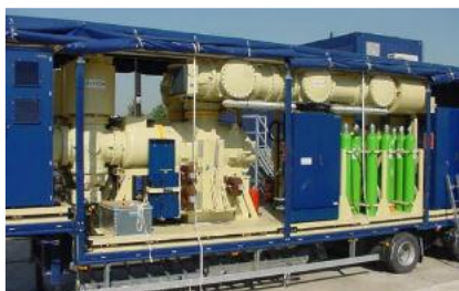
GAS NATURAL FENOSA (SPAIN) 132/66 kV 4 GIS bays

As a company, GE has a strong presence in all regions. This enables our team in Madrid to work closely with GE colleagues virtually anywhere in the world. These global resources help ensure rapid development and commissioning of mobile substations with the help of local knowledge and resources to deliver our solutions in an efficient and responsive manner. We can be close to our customers, wherever they are.