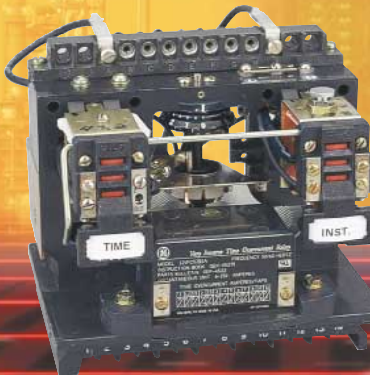
Time-overcurrent protection of AC circuits and apparatus.