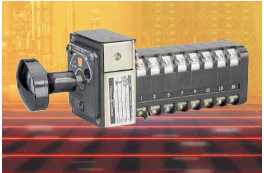
Multi-contact hand reset relay to perform auxiliary functions on AC and