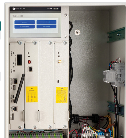
Location of maximum 3 x add-on cards

††Based on testing carried out using Voltesso™ 35 mineral oil, over a ¼" pipe run of 10 metres or less from oil supply or return valve to monitor connection point and on transformer oil supply valve volumes of 200 ml or less. For oil temperatures colder than -20 °C GE Vernova recommends the use of heat trace cabling on piping