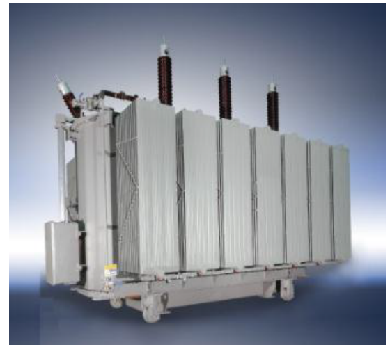
Green Power Transformer 110 kV, 31,5 MVA