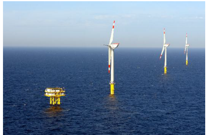
75 MVA 115 / 31 kV hermetic transformer with vacuum tap changer and MS3000 monitoring system for off-shore wind farm Alpha Ventus in operation since 2008

For more information, visit governova.com/grid-solutions