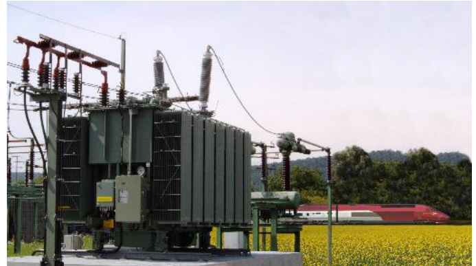
15 MVA 120/17.25 kV 16.7 Hz track-side hermetic transformers for railways

In the past decade, a German railway operator purchased large series 10 and 15 MVA hermetically-sealed Green Power Transformers with patented expandable radiators and vacuum tap changers for reduced maintenance costs, optimized overload capacities and longer life time.