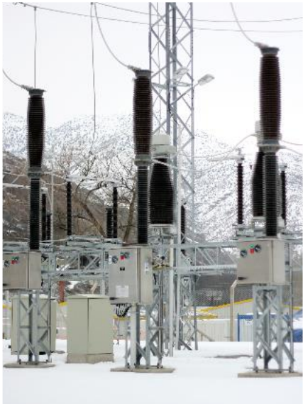
170 kV live-tank CB with single-pole operation