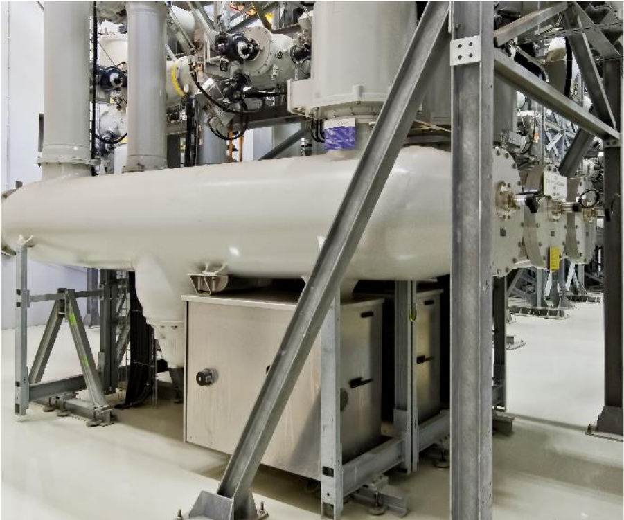
550 kV GIS CB