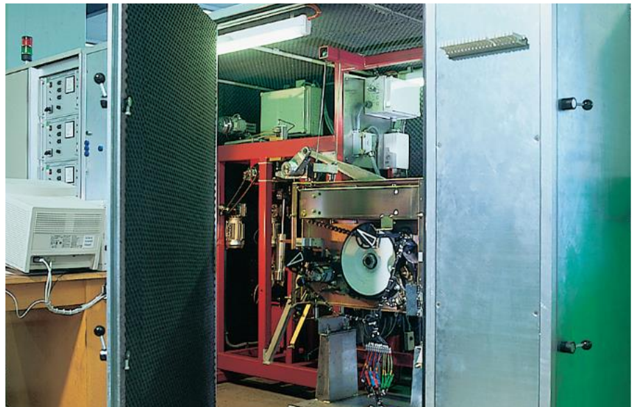
Spring mechanism routine test station

Eight decades of experience are continuously supporting the implementation of total quality throughout the entire spring drive process, from engineering to operation, then after-sales.