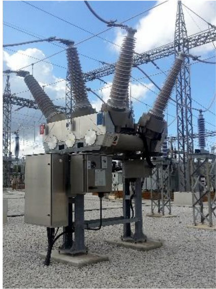
145 kV hybrid switchgear