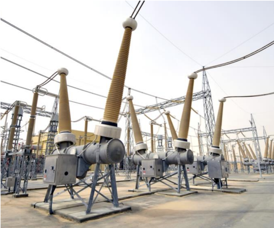
550 kV dead-tank CB