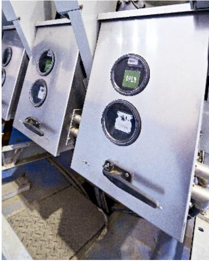
245 kV GIS CB