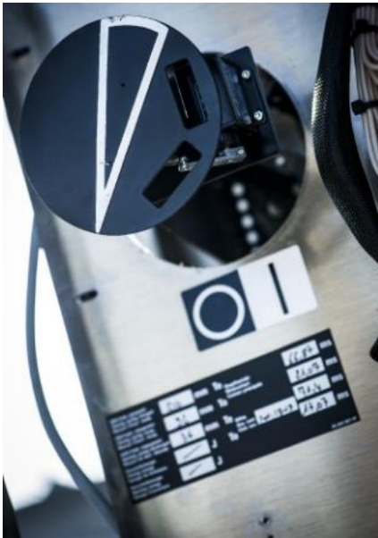
FK pure-spring drives are the unmatched benchmark of circuit-breaker operating mechanisms

Grid Solutions' spring drives meet the challenges of AIS, GIS and Generator Circuit-Breakers, up to 800 kV.