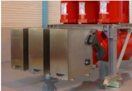
420 kV GIS single-break CB