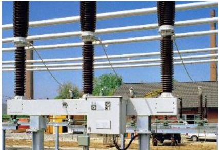
170 kV live-tank CB