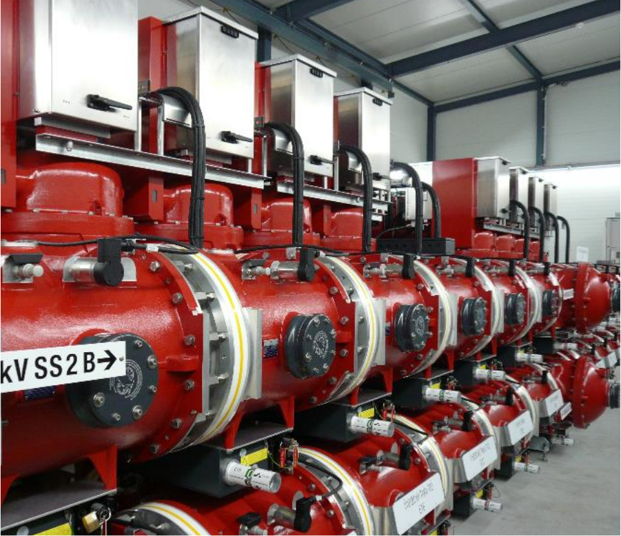
145 kV GIS CB