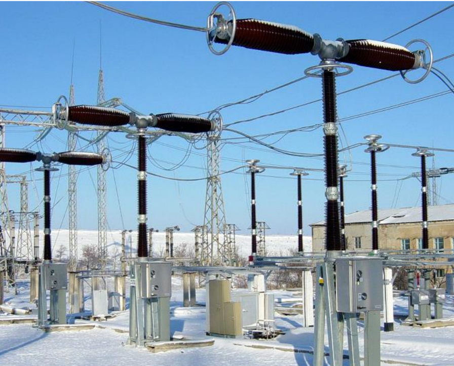
550 kV live-tank CB