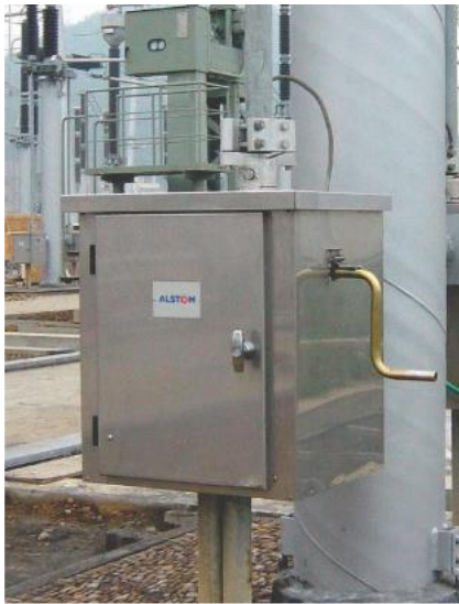
CMM Motor Operating Mechanism

The primary function of a motor operating mechanism is to provide reliable remote operation of disconnectors by means of a torsional pipe.