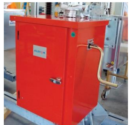
Painted mechanism for added protection against corrosion

Our mechanisms can be painted for added protection in particularly aggressive environments. Further details are available upon request.