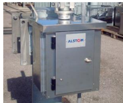
CML Manual lever operating mechanism

Grid Solutions has designed a range of mechanisms to meet the specific needs of railway applications. Full details on the various models available can be found in the disconnector brochure dedicated to railway applications.